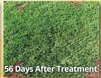
56 Days After Treatment

1:24 applied at 18.6L/1000 sq ft 2nd app, same rate