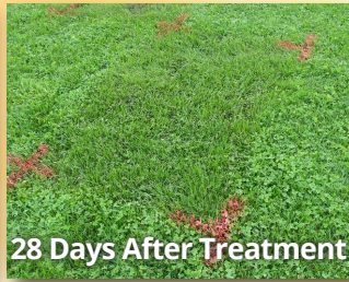
28 Days After Treatment

1:24 applied at 18.6L/1000 sq ft 2nd app, same rate