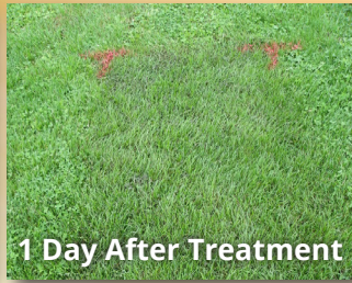
1 Day After Treatment